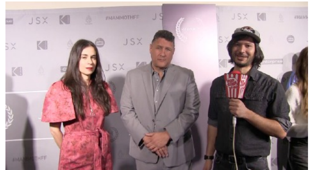
Popcorn Talk Interviews at the 2020 Mammoth Film Festival.