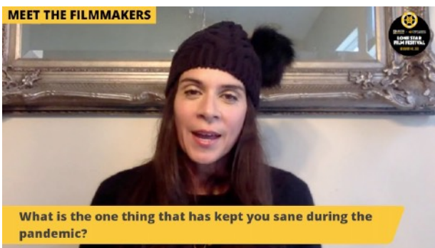
Click Images to Watch on YouTube.